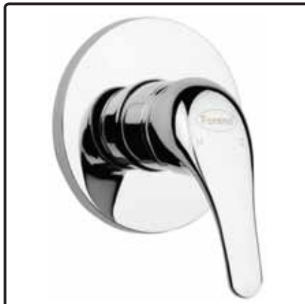
Foreno Shower Mixer PSM5

Mains Pressure Water Efficiency: ★★★★ Water Consumption: 7.5L/min. Low /Unequal Pressures Water Efficiency: ★★★ Water Consumption: 9L/min. 2 Year Guarantee Suitable for: Unequal / Mains Pressure