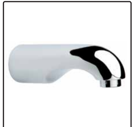
Foreno Bath Spout BF7

Mains Pressure Water Efficiency: N/R Water Consumption: N/R Low /Unequal Pressures Water Efficiency: N/R Water Consumption: N/R 5 Year Guarantee Suitable for: Unequal / Mains Pressure