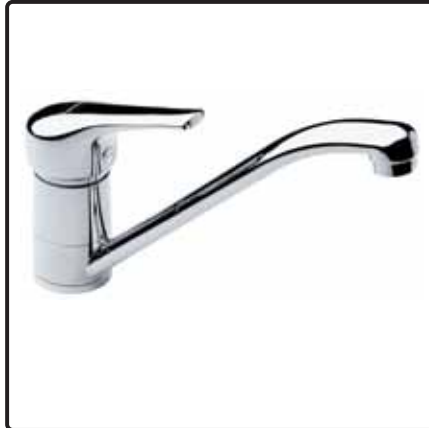
Foreno Sink Mixer PMX1

TRENZ HOMES innovative housing solutions