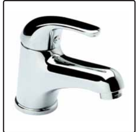
Foreno Basin Mixer PMB5

Mains Pressure Water Efficiency: ★★★ Water Consumption: 8L/min. Low /Unequal Pressures Water Efficiency: ★★★ Water Consumption: 8.5L/min. 2 Year Guarantee Suitable for: Unequal / Mains Pressure