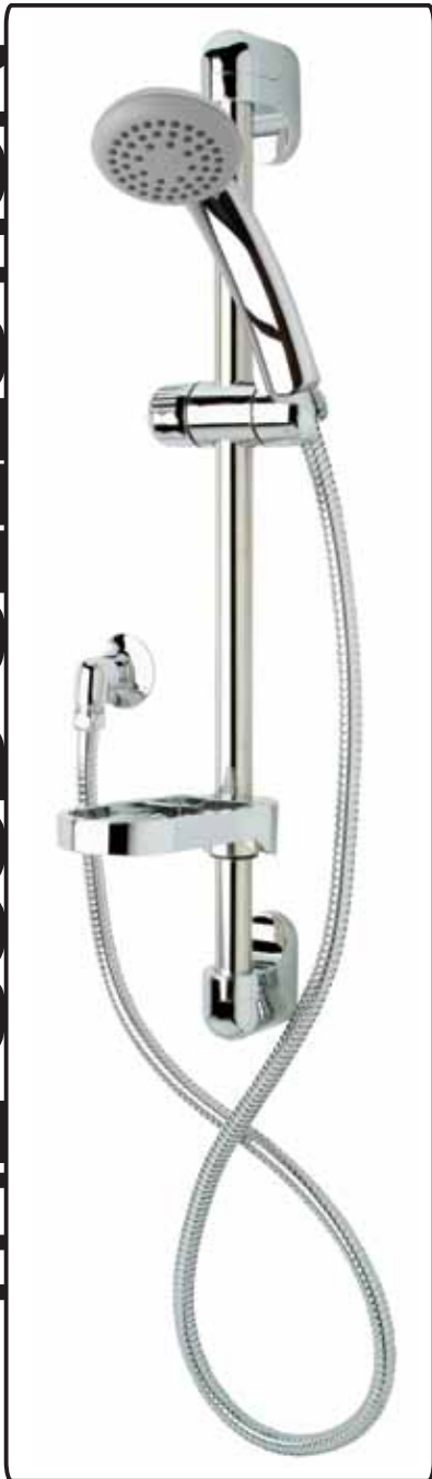
Foreno Slide Shower PSL8

Mains Pressure Water Efficiency: ★★★ Water Consumption: 8L/min. Low /Unequal Pressures Water Efficiency: ★★★ Water Consumption: 70L/min. 2 Years Guarantee Suitable for: All Pressures